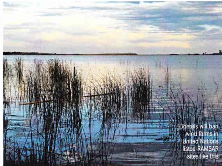
Liberals will ban wind farms in United Nations listed RAMSAR sites like this